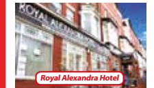
Albert Road, Town Centre

* Prices vary per hotel and departure date. Lowest price (£129pp) applies to Mystery Hotel holidays available on selected dates up to 22nd June 2018.