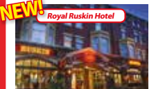
Albert Road, Town Centre