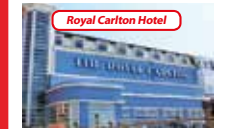
Central / South Prom